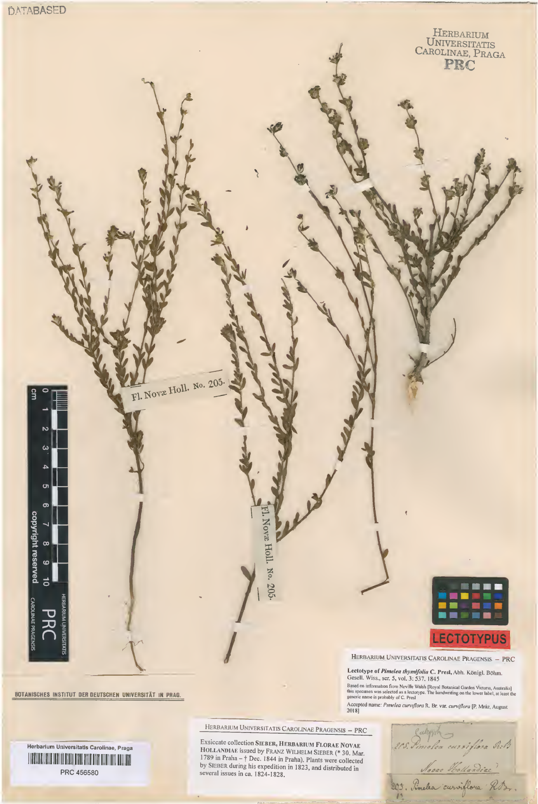
Figure 6. Lectotype of Pimelea thymifolia (PRC 456580).